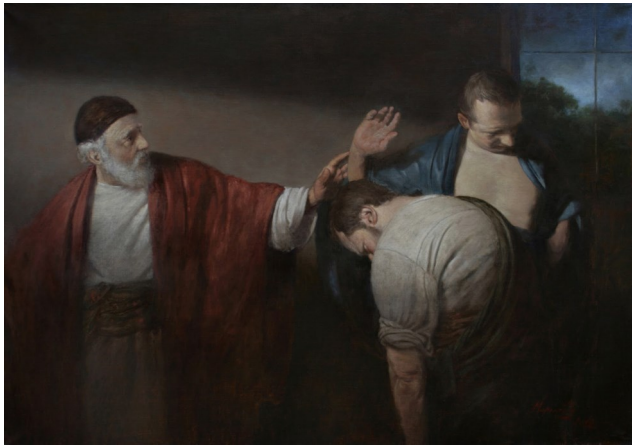
Parable of the Two Sons Andrei Mironav (1975—)